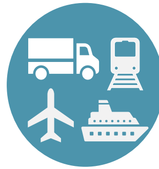
TRANSPORTATION & LOGISTICS SERVICE PROVIDERS