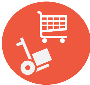
RETAILERS & WHOLESALERS