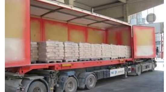
Multitainer 36 – H