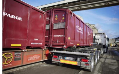
30 ft bulk materials container