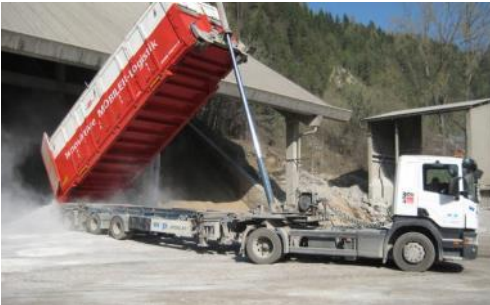
30 ft Multitainer with bulk materials