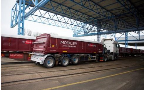
30 ft Halftainer