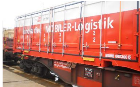
Multitainer 36 – K