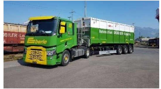
BIO grain container